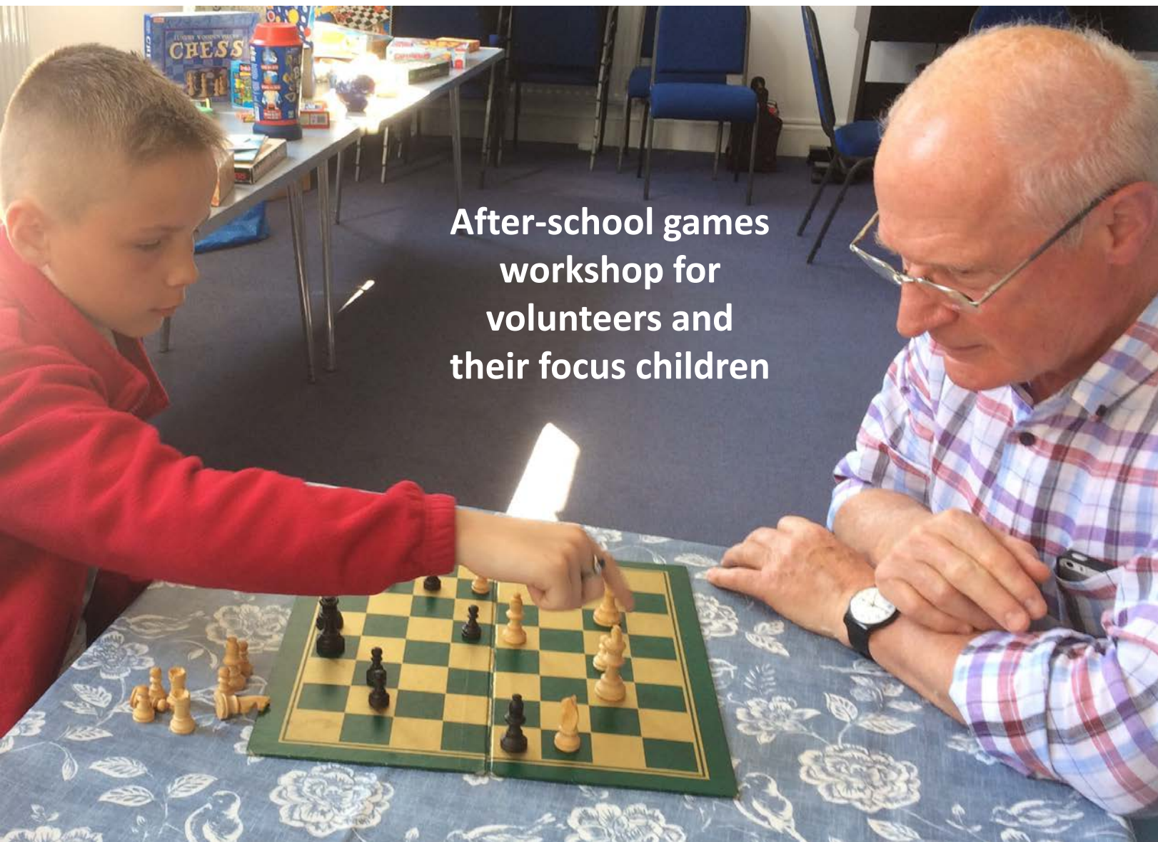
After-school games workshop for volunteers and their focus children