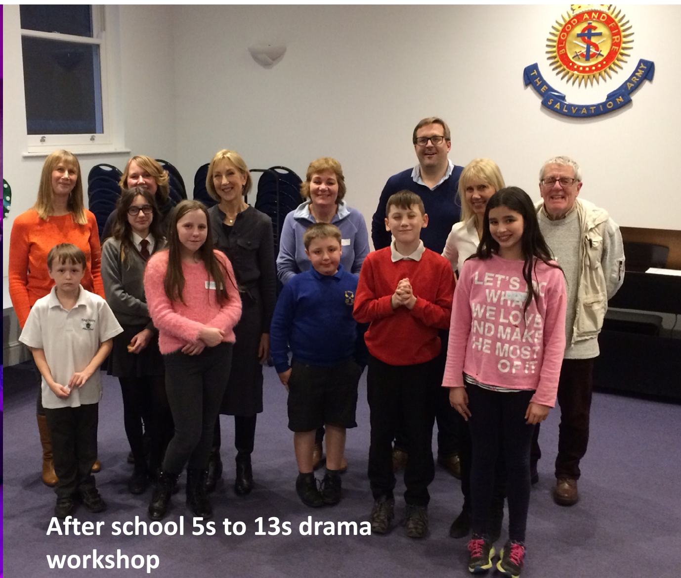
After school 5s to 13s drama workshop