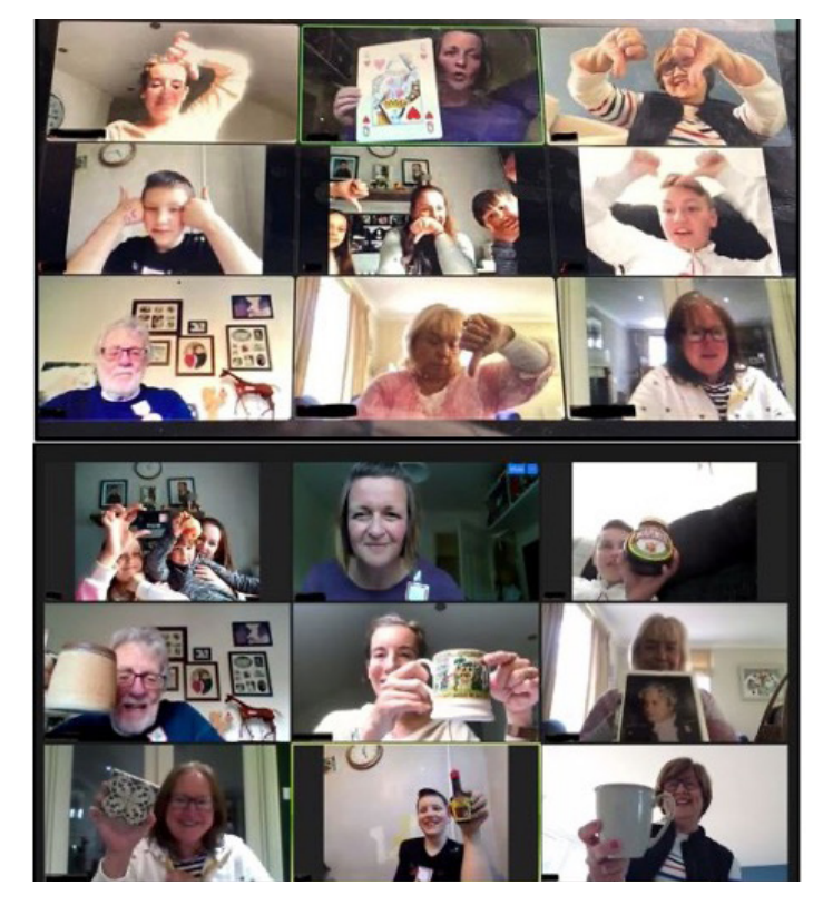
Zoom Quiz - Family Fun Fridays

"My volunteer is a very good listener. We have fun together and I can talk to her about what's on my mind'"