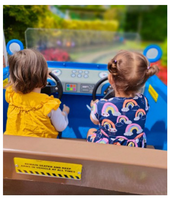
Mums & Young Children Day Out