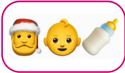
Santa Baby - Eartha Kitt